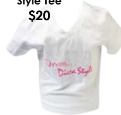
Dream DIVA Style Tee $20