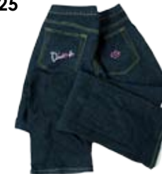
Swarovski Crystal DIVA Jeans $35 (cost does not in- clude jeans)