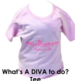
What's A DIVA to do? Tee $20