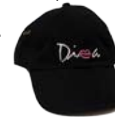
Swarovski Crystal DIVA Hat $30