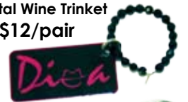
Swarovski Crystal Wine Trinket $12/pair