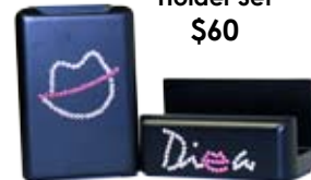
Swarovski Crystal Pen & Business Card Holder Set $60