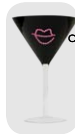
Swarovski Crystal DIVA- TINI Glass $25