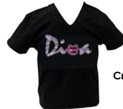
Swarovski Crystal DIVA Tee $65