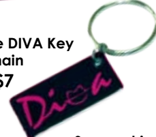
Signature DIVA Key chain $7