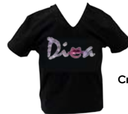
Swarovski Crystal DIVA Tee $65