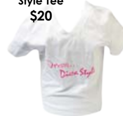
Dream DIVA Style Tee $20