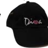
Swarovski Crystal DIVA Hat $30