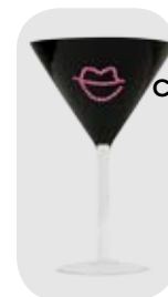
Swarovski Crystal DIVA- TINI Glass $25