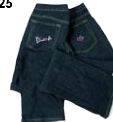
Swarovski Crystal DIVA Jeans $35 (cost does not in- clude jeans)