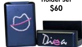
Swarovski Crystal Pen & Business Card Holder Set $60